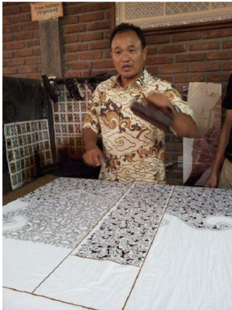
Figure 1. Stamping in Batik Cap

1 The second phase, mewarnai, involves the 1 plouring process where the fabric is dyed. The waxed parts are protected from coloured during this process and remain dye-free. The dyed fabric, with wax still on is then dried and soaked in a bath of colour-fixing agent.